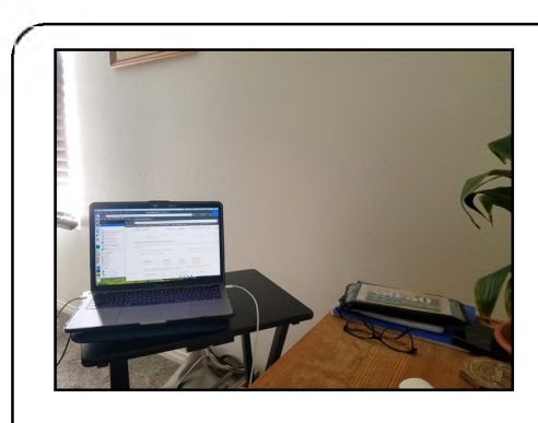
Linda's office is quiet and peaceful with a couple of furry friends to cuddle with.