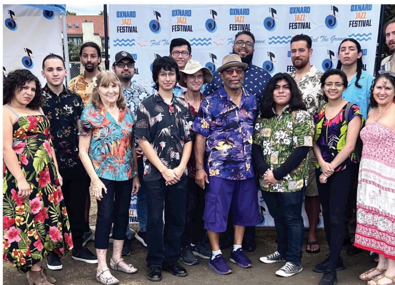
Ventura College Jazz Band, 2022