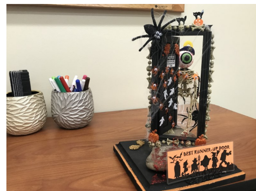
The IE Data Squadron currently holds the trophy for the 2nd scariest door on campus!