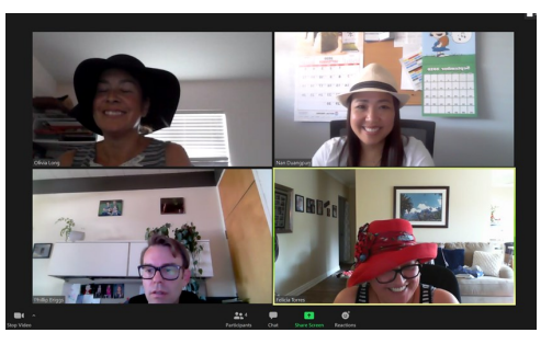
An exciting IE Team Meeting