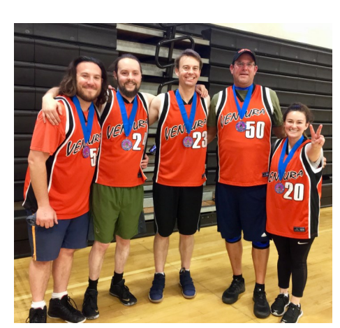
VC's <u>Corporate Games Dodgeball team</u> took home a silver medal this year!!