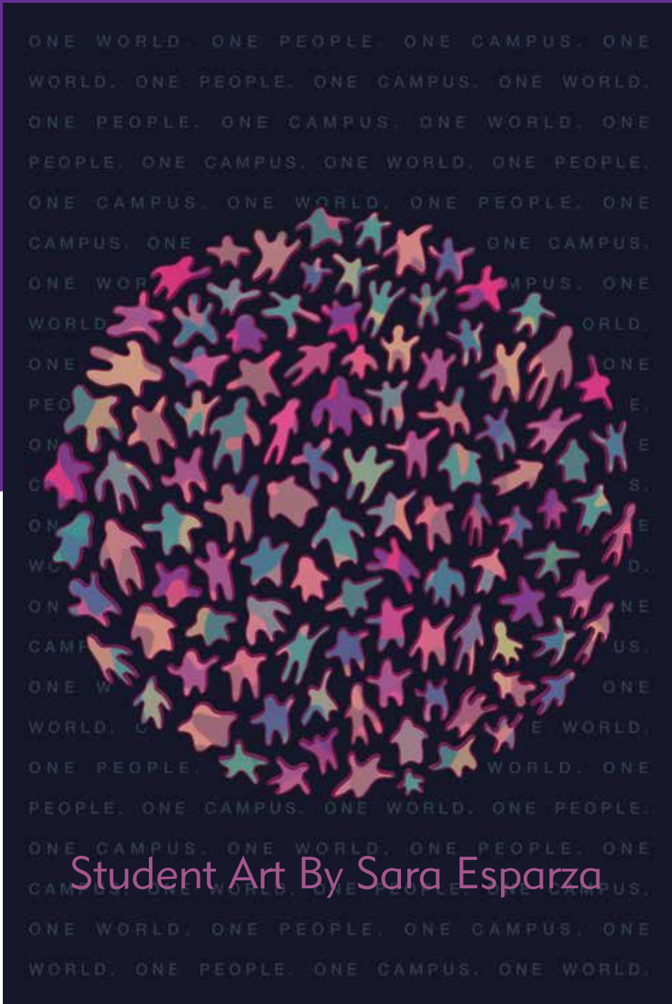
Student Art By Sara Esparza