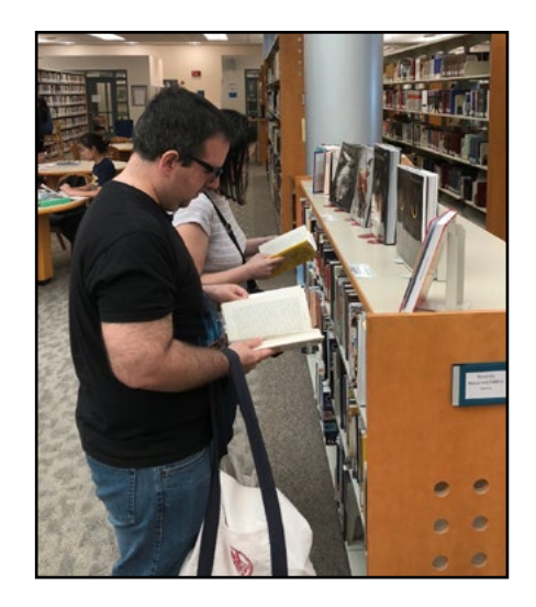
Above: Students browse our newly added books.