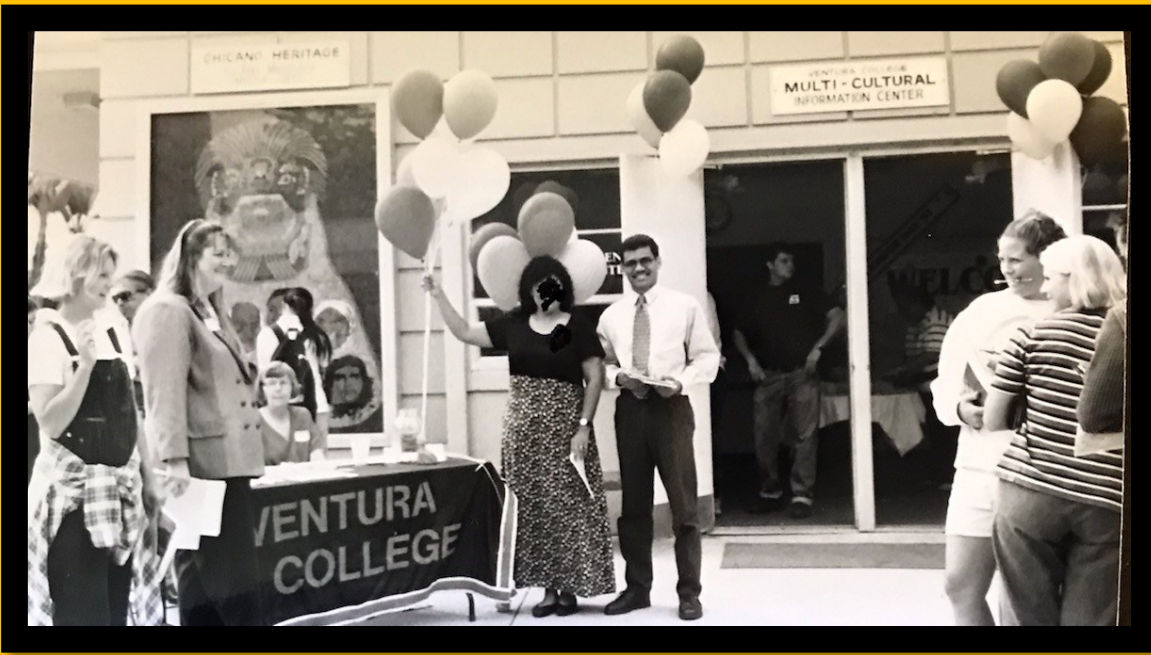
The Multi-Cultural Information Center operated under the supervision of the EOPS Program at VC