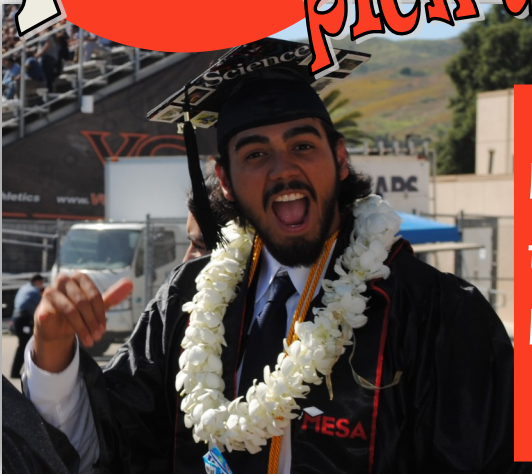
photo booth refreshments music

EOPS Graduates will meet at 8:30 a.m. at the Campus Student Center Lounge located next to the ASVC.