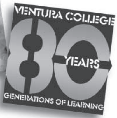
Happy Birthday, VC: we opened our doors in 1925! (Pirate cake by Sibling Bakery, Ventura; four Anniversary cakes by Royal Bakery, Ventura)