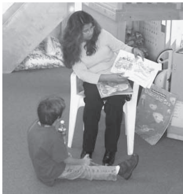
A staffer reads to a child during the ASVC Read-a-thon at the Child Development Center.

California State Child Development permits are awarded at six different levels. These are: assistant, associate teacher, teacher, master teacher, site supervisor, and program director. See CD department or counselor for further information.