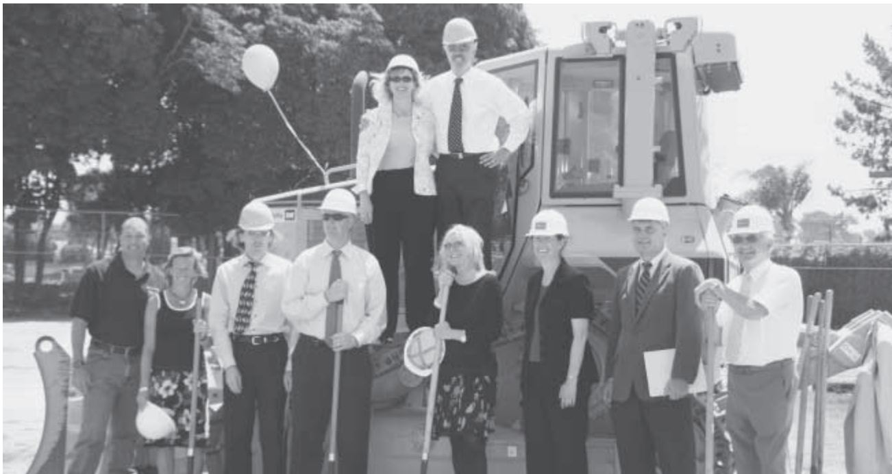
Groundbreaking for Sports Complex

Ventura College assumes no responsibility for damage to any motor vehicle, theft of its contents, or injury to persons within it, while it is parked or operated on or about the campus. The campus is posted with special parking restrictions in effect and campus traffic and parking regulations are published in the appendices. These provisions are strictly enforced by the campus police department.