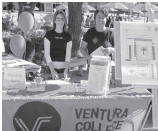
VC Counselors on Transfer Day, Fall 2006