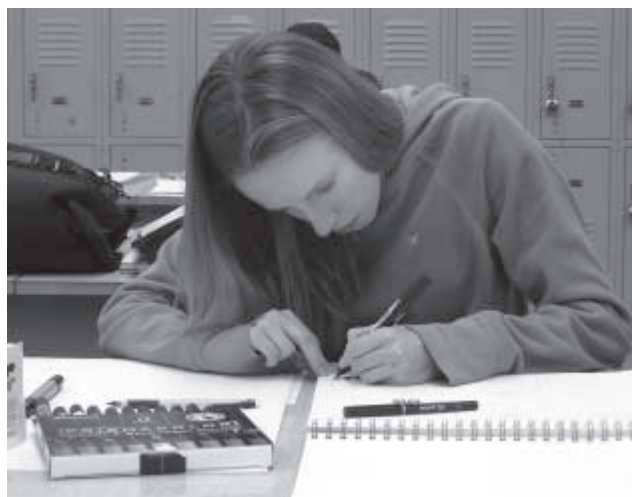
Working on final graphic design project

Recommended courses: MATH V01 or V11A, V11B; MICR V01.