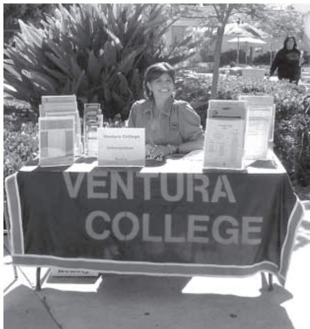
VC Counselor at Transfer Day

ASSIST — ASSIST is a computerized transfer information system that can be accessed over the World Wide Web. It displays reports of how course credits earned at one California college or university can be applied when transferred to another. ASSIST is the official repository of articulation for California's public colleges and universities and therefore provides the most accurate and up-to-date information available about student transfer in California. ASSIST is available at www.assist.org