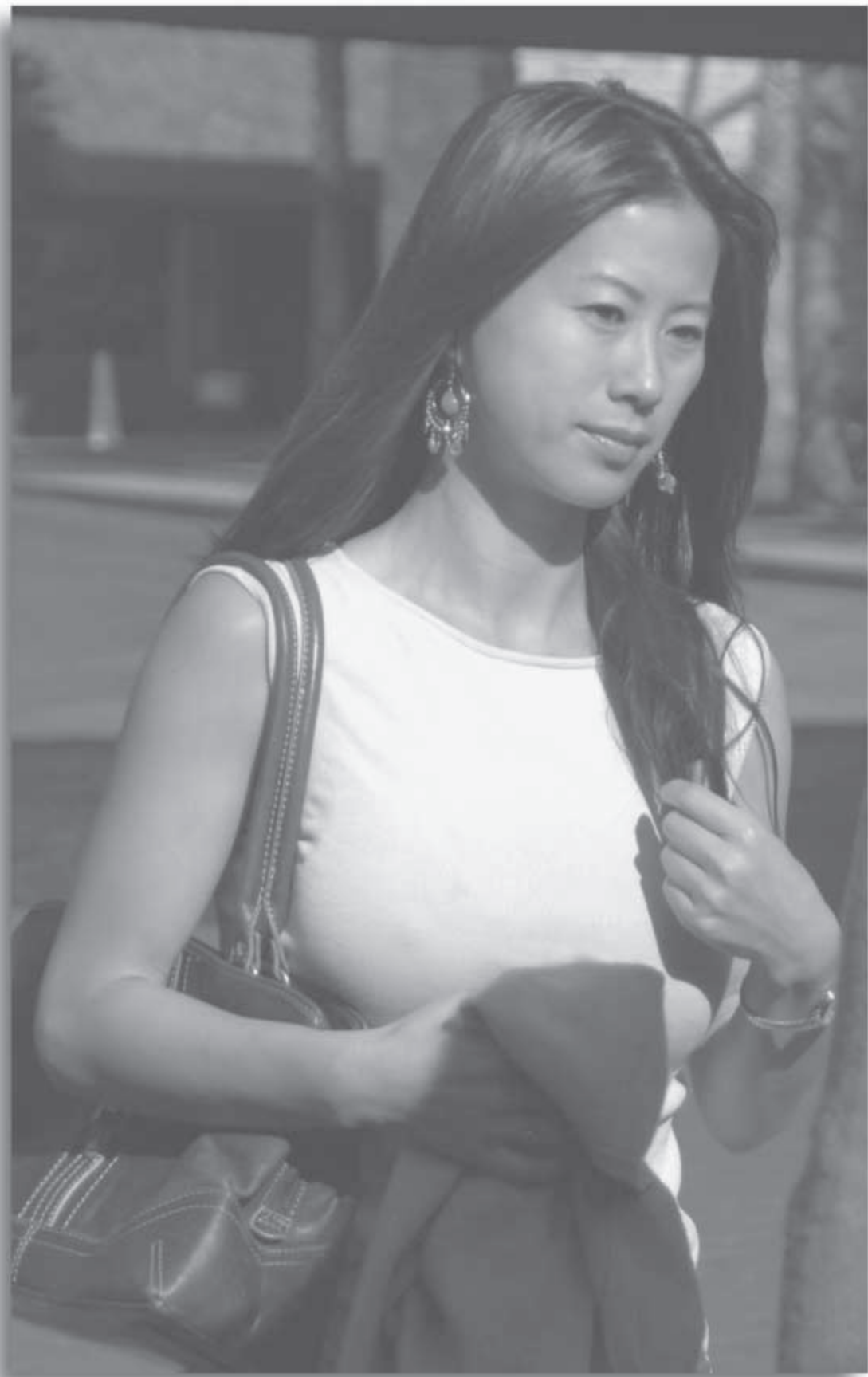
Arriving at the VC Foundation Scholarship Ceremony