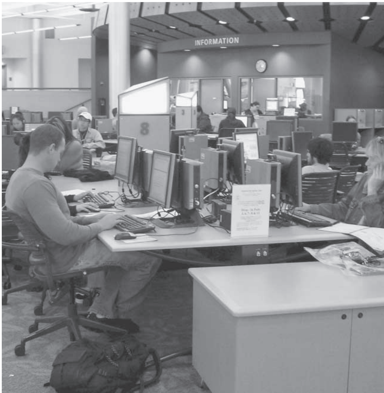
The B.E.A.C.H. provides state-of-art tools for students and the public.

The Tutoring Center is located on the first floor of the Library and Learning Resources Center. For more information, please call (805) 648-8926. Tutoring is also available at the East Campus in Santa Paula. All college students may use the Tutoring Centers at either site. Please call (805) 525-7136 for more information at the East Campus.