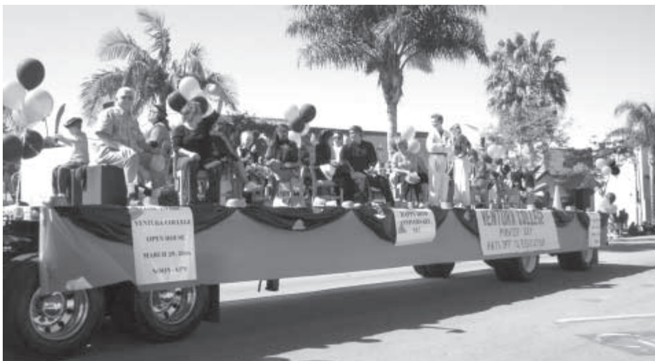
The winning VC float at St. Patrick's Day Parade