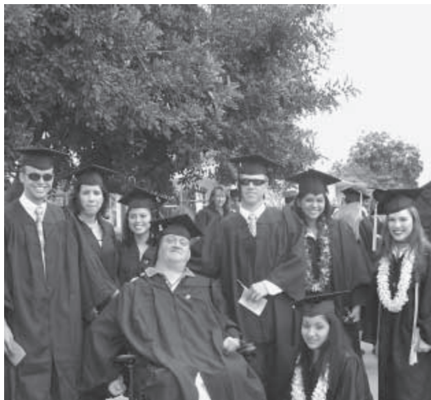
2006 VC Grads

The general education requirements for the California State University, Intersegmental General Education Transfer Curriculum, the University of California at Santa Barbara, California Lutheran University, and the University of La Verne are in the following section.