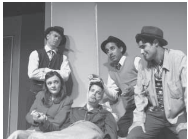
VC Theatre Department presented "Room Service".

Recommended courses: MUS V13A; PE V40; SPCH V04, V05; THA V03.