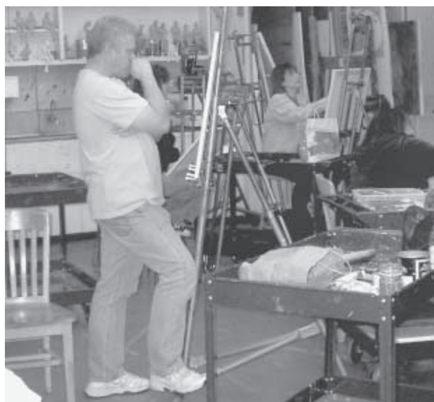
Ventura College has a nationally known Art and Photography Department.

For specific majors in ceramics, commercial art or photography, please see these majors in this Catalog.