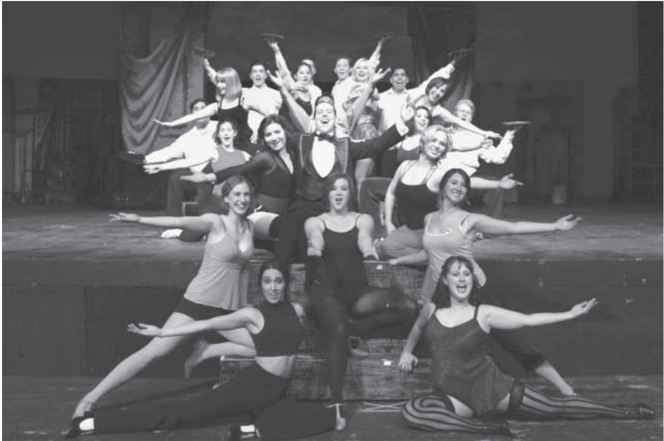
The VC Opera and Musical Theatre cast in "Cabaret," Spring 2006

Development of special skills in a particular area of the trade. Fees will be required. Formerly Wel 97.