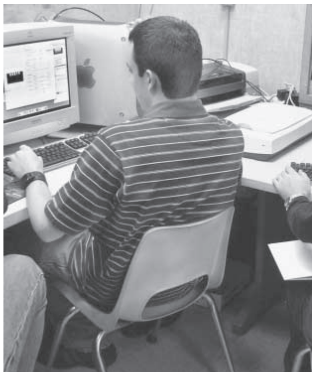
A VC student utilizes one of the up-to-date MACs in the lab