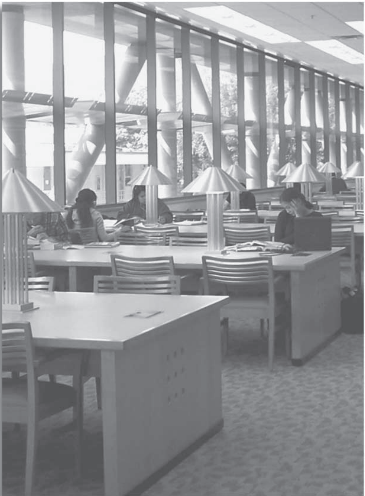
Students enjoy the new Library.