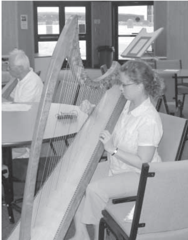
The Celtic harp class— one of hundreds of VC Community Education classes

Students transferring to universities with national professional accreditation are limited to fifteen (15) lower division units in journalism and related fields that will apply to the baccalaureate degree.