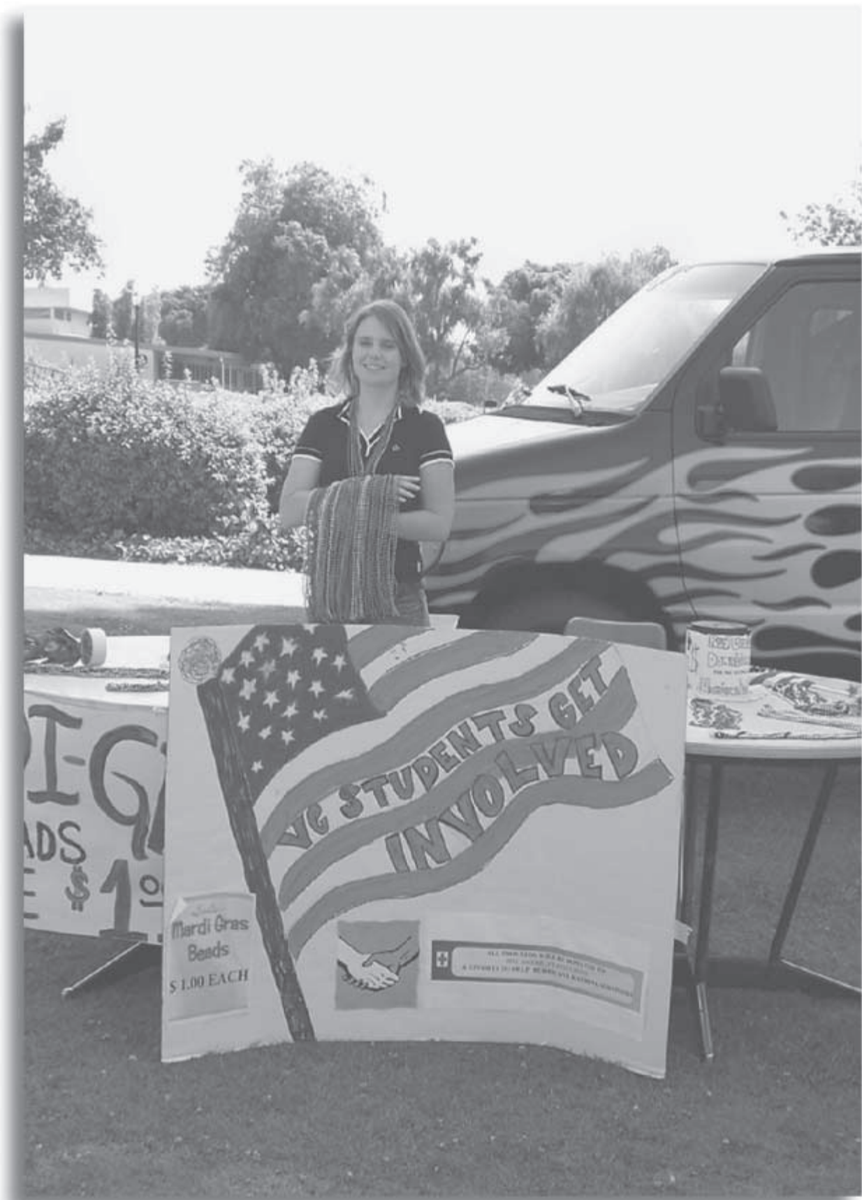
VC Students involved in Hurricane Katrina Relief