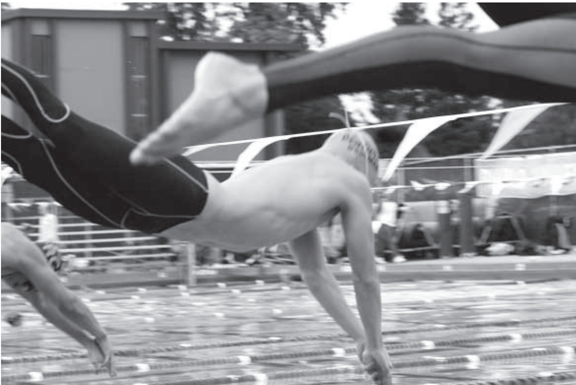
VC Swim and Dive team - winners of the 2005 State Championship