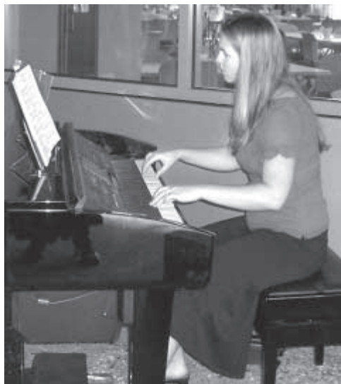
VC music student performs for President's reception

General information about SRTK is available to the public through the Chancellor's Office of the California Community College System Web site: http://srtk.cccco.edu/index.asp . Specific information on the most recent cohort for Ventura College is available at http://srtk.cccco.edu/683/02index.htm .