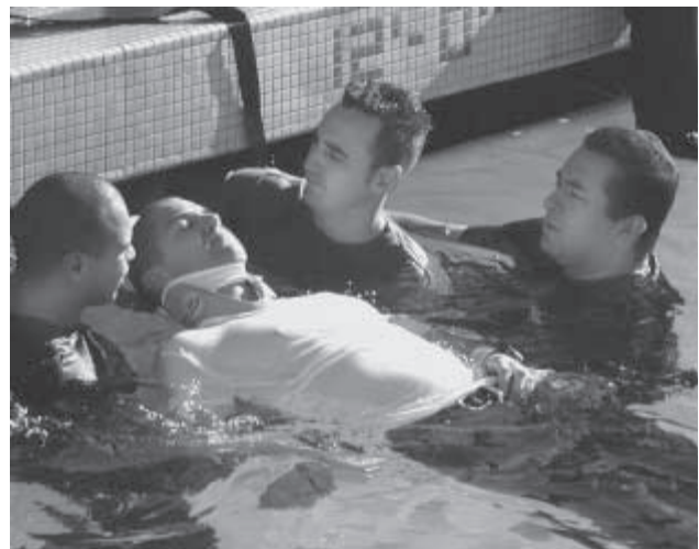
Paramedic students practice water response techniques

The program is accredited by the California State Emergency Medical Services Agency and the Ventura County Emergency Medical Services Agency. To be eligible to take the examination leading to licensure as a paramedic, the student must have fulfilled all requirements as defined by the Ventura County Emergency Medical Services Agency and the state of California.