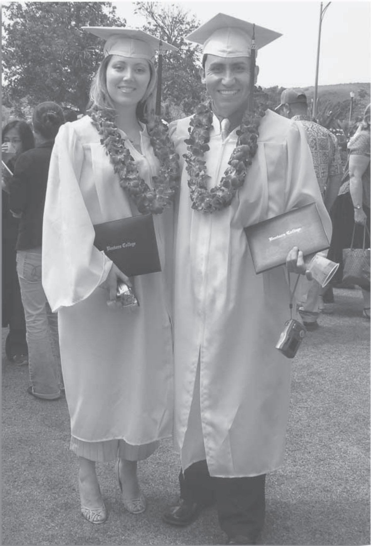
Nursing Graduates are ready to serve.