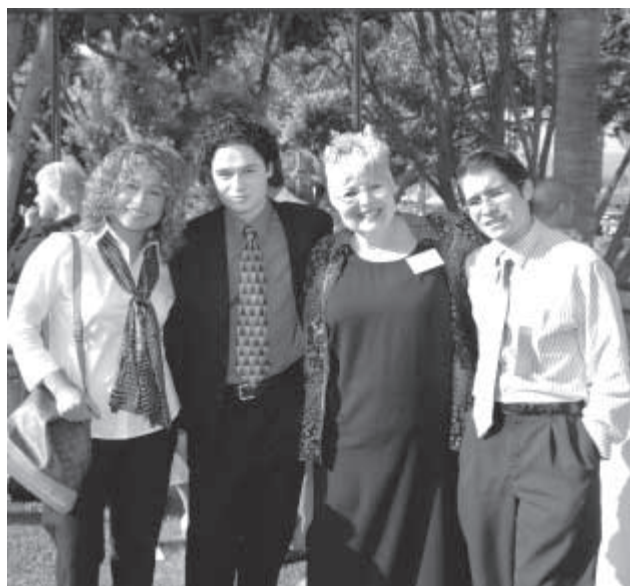
Group at VC Foundation Scholarship Dinner

Recommended courses: ART V06, V12B, V13B, V13C, V18A, V18B, V28C, V29C, V32A, V37A, V43A, V44A, V46A, V46B, V48, V75; FDM V18A, V18B; IDS V74A, V74B; PHOT V02, V04A.