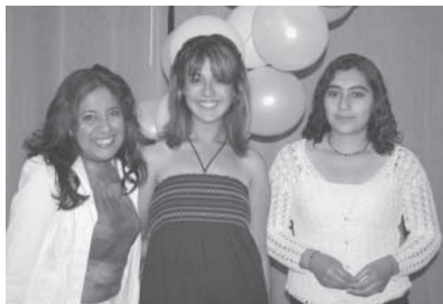
EOPS students at awards banquet