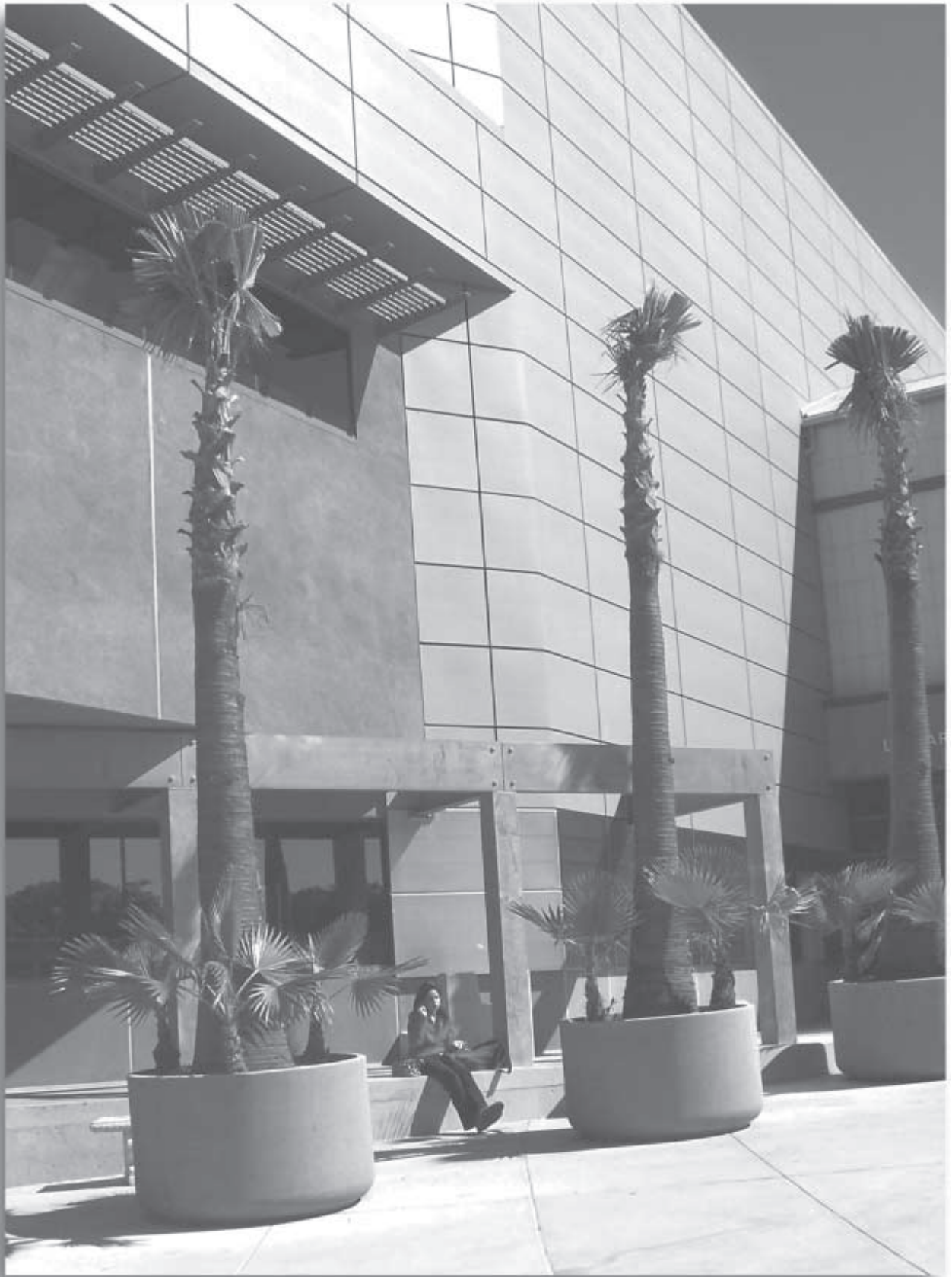
The LRC is a great place to work and relax.