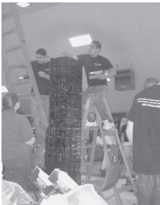
Ventura College S.H.P.E. and M.E.S.A. students construct a tower of Hershey bars at the Chocolate Festival