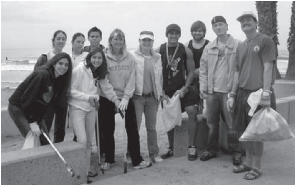
The Psychology Club helped out with the 2006 Earth Day beach clean-up.