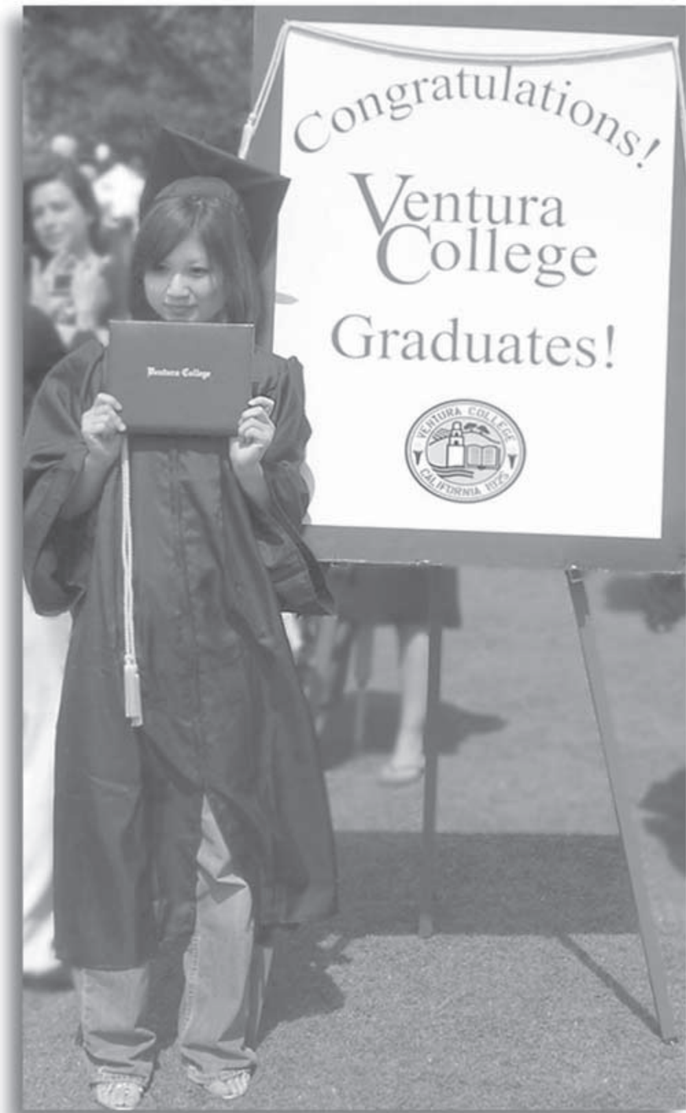
2006 Ventura College graduate