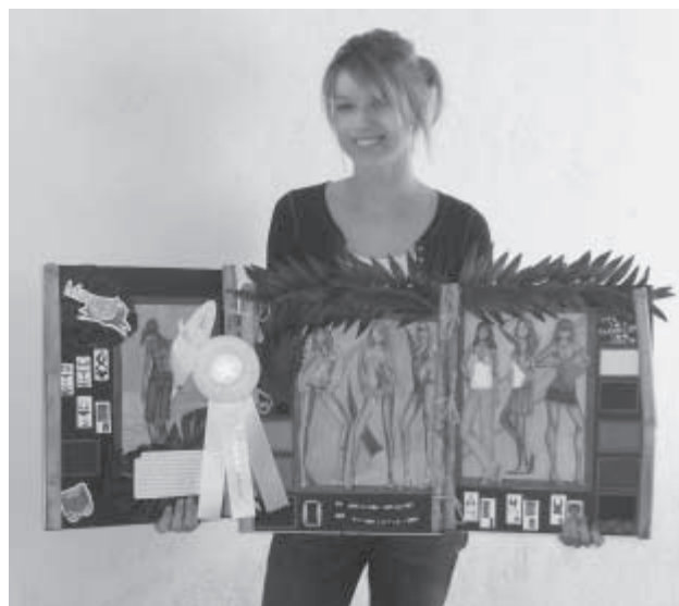
Fashion Design & Merchandising student displays her project, which won state-wide honors.

Credit by examination (CRE) is assigned for work of such quality as to warrant a letter grade of C or a better. Transcript entries shall distinguish credits obtained by examination from credits obtained as a result of regular course enrollment. The student's academic record shall be clearly annotated to reflect that credit was earned by examination. Students should be aware that other colleges may not accept credit by examination for transfer purposes.