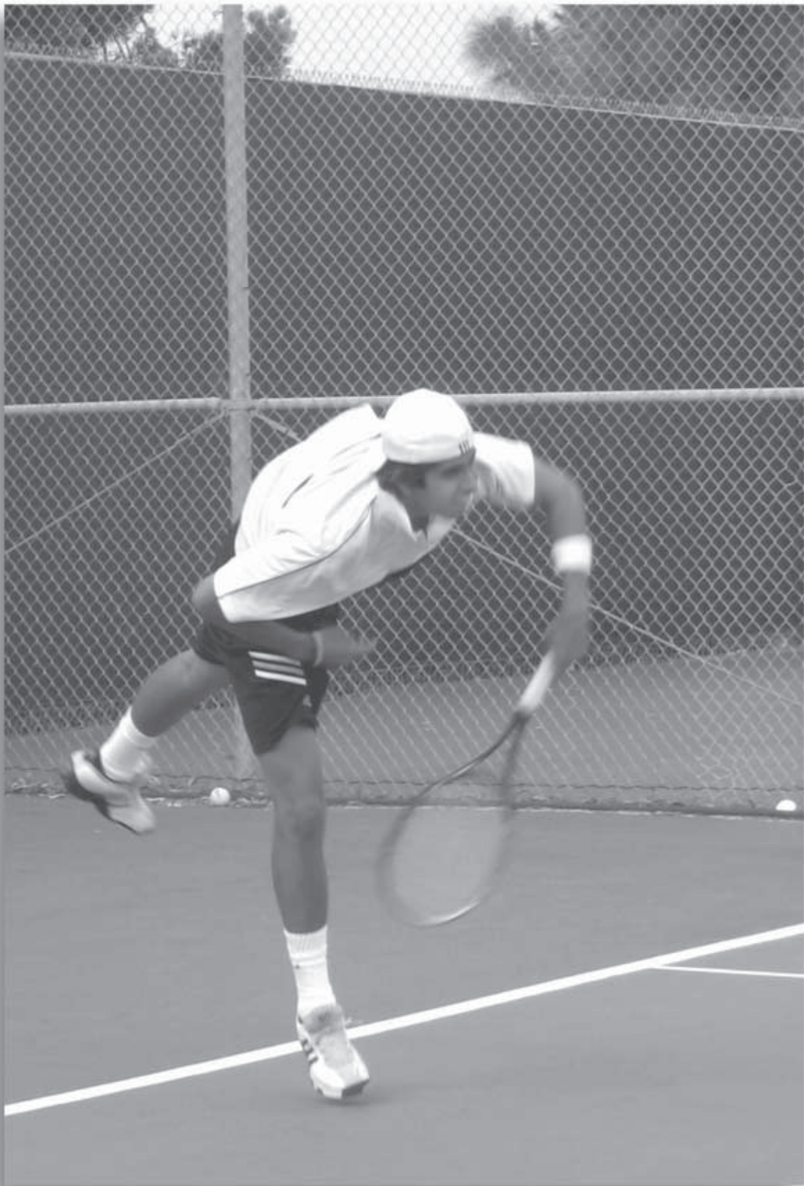
VC Tennis Team serves up a win.