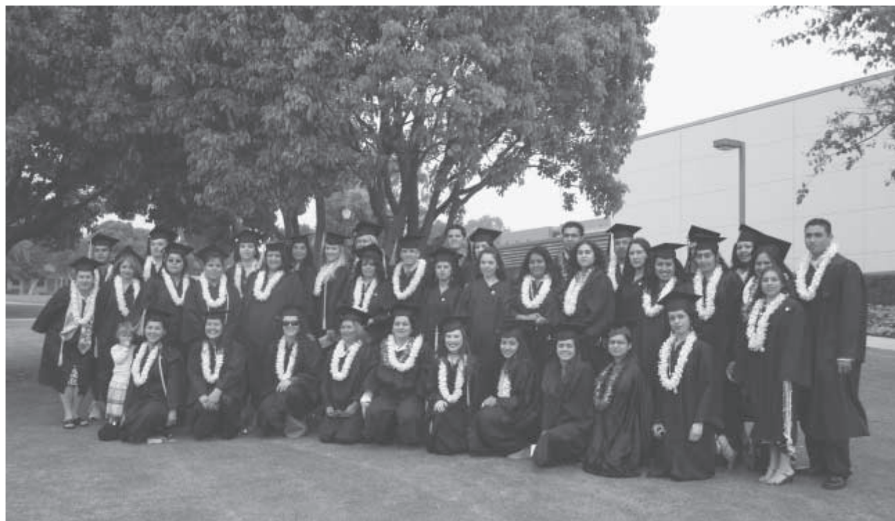
Extended Opportunity and Program Services (EOPS) 2006 Grads

B.S.N., 1972, University of California, San Francisco; M.S.N., 1981, University of California, San Francisco