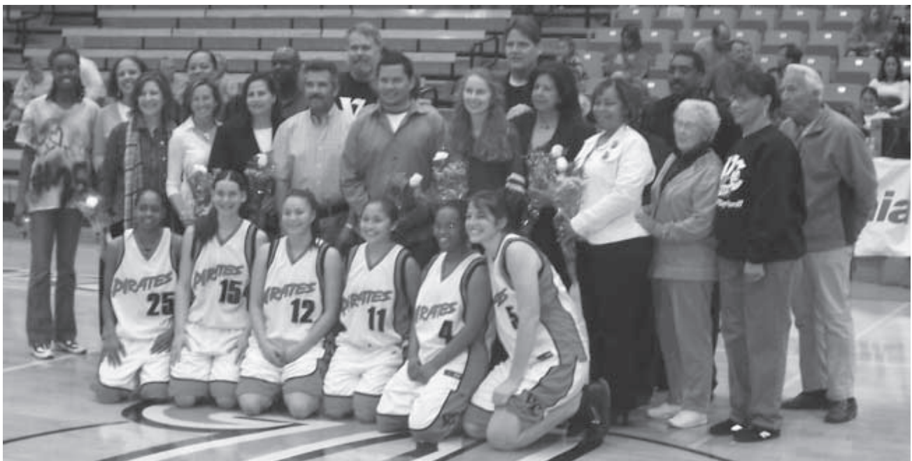
VC Women's 2005-06 basketball team with their parents and College mentors

Ventura College is committed to serving special student populations, referred by local, county, state, federal and private agencies. Examples include students who are referred through the Business and Employment Services Division of the County of Ventura (BESD), which administers the Workforce Investment Act (WIA), as well as those referred through private rehabilitation firms. The College provides support services which include assistance with registration, assessment, counseling, financial aid, and customized vocational planning. For more information about BESD, the WIA, or customized training, please call the Ventura Institute for Community and Professional Development at (805) 648-8904.