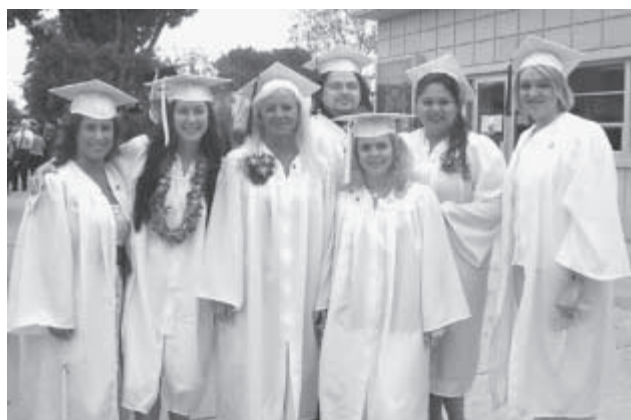
2006 Nursing Graduates

Highly recommended courses: Although not required, it is strongly recommended that the following courses be taken prior to admission into the ADN program: MATH V30; NS V07, V75.