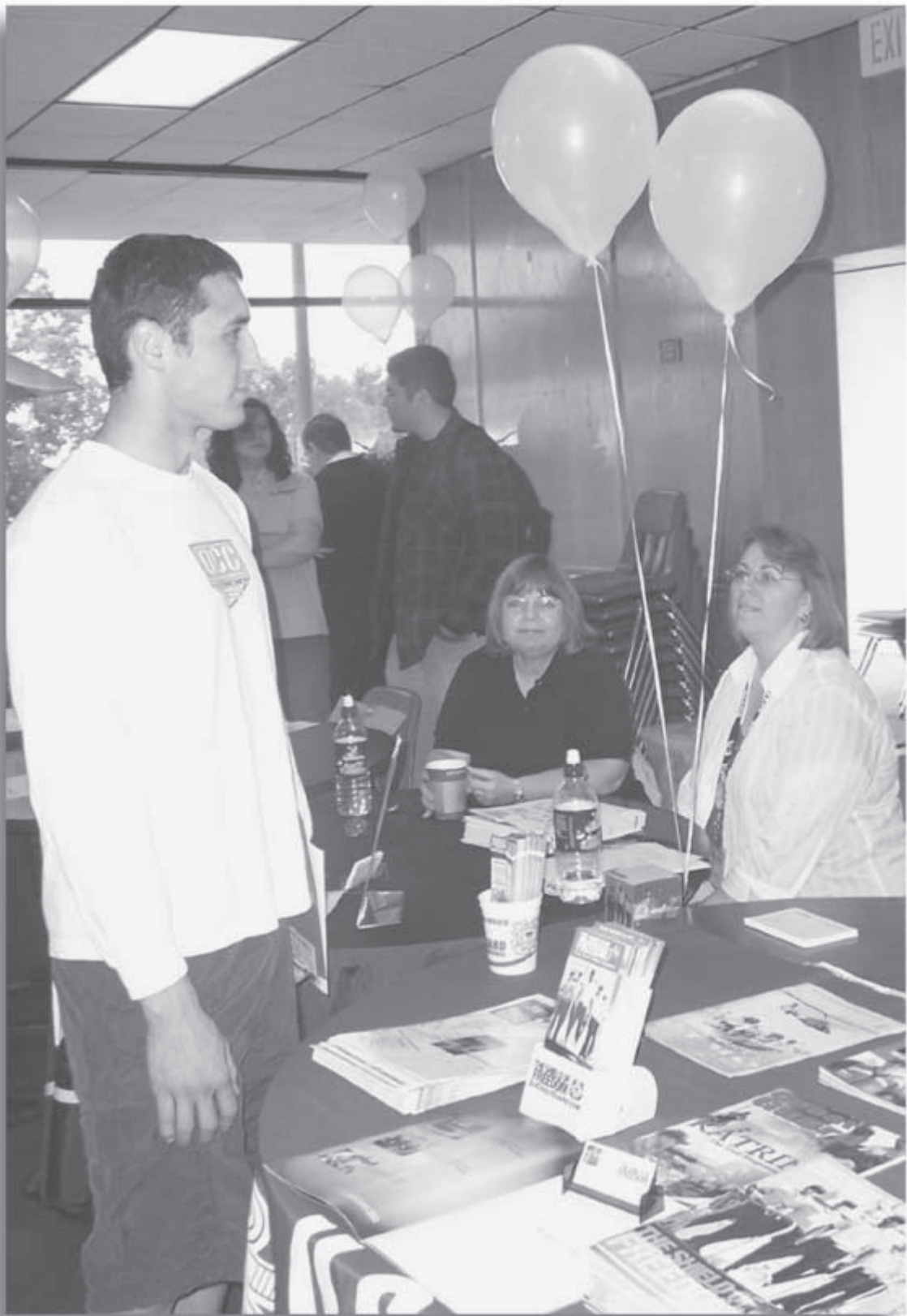
The annual Job Fair helps students plan ahead.