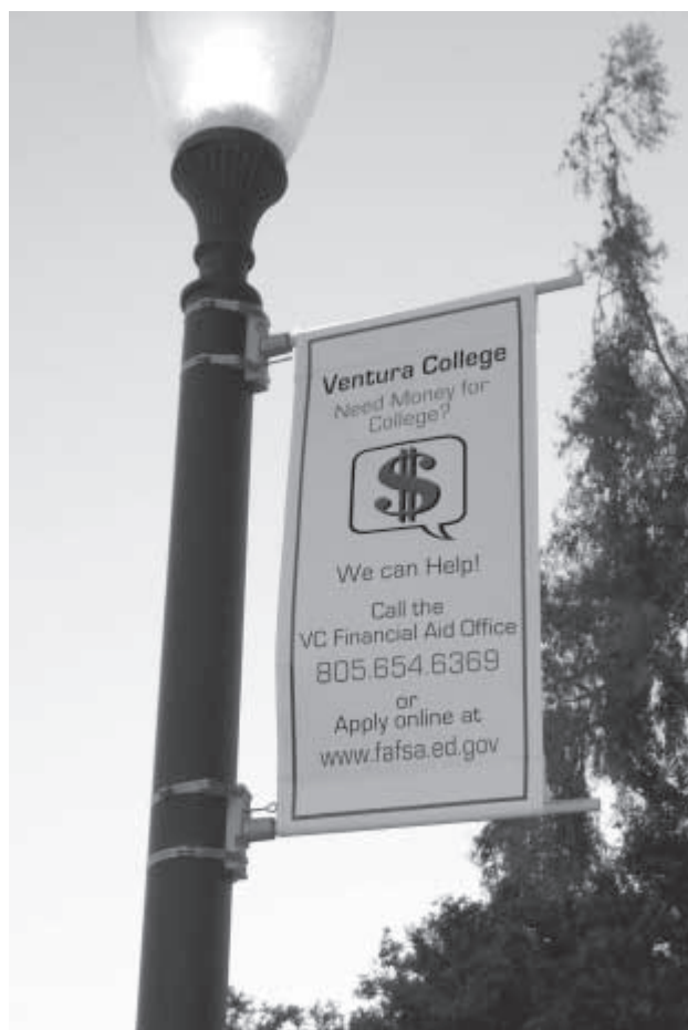
The VC Financial Aid Office is here to help!

The institution will use the following definition of withdrawal date: Official is the date the student notifies the school of his or her intent to withdraw. Unofficial withdrawal is the last recorded date of attendance (as documented by the institution).