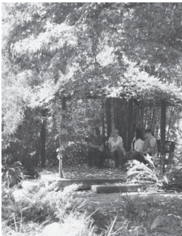
The VC Japanese garden

Recommended courses: CHEM V01A-V01AL, V01B-V01BL, V12A-V12AL, V12B-V12BL; ECON V01A, V01B; HED V92.