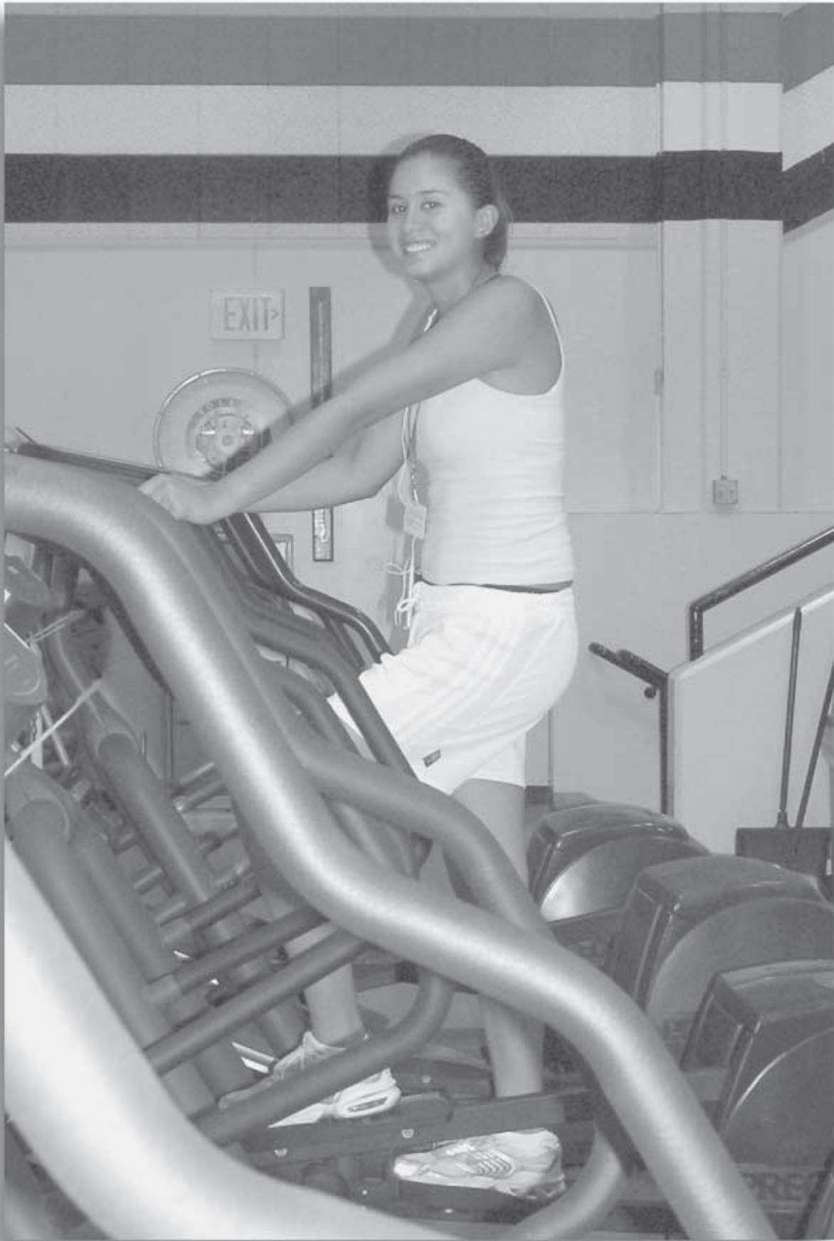
VC Fitness Center helps both mind and body.