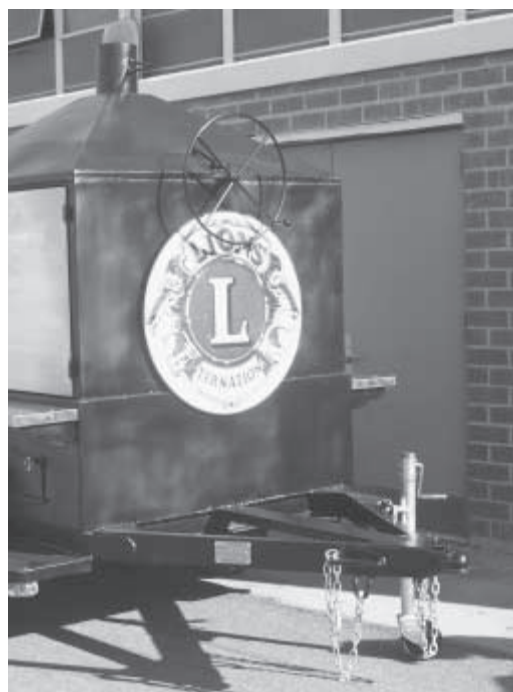
Barbeque made by VC welding class

Recommended courses: ARCH V11; CT V20; DRFT V02B; ENGL V02; PHYS V01.